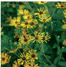
Rudbeckia Subtomentosa or 'Henry Eilers' Sweet Coneflower

Sneezeweed blooms in Late Summer-Mid Fall. It grows 4-6 feet tall and likes full sun. It's 2-3 inch wide flowers are highly attractive to bees. It is a good cut flower. Sneezeweed tolerates drought,