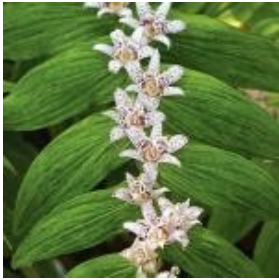
Tricyrtis 'Lightning Strike' or Variegated Toad Lily

This plant grows 4-5 feet tall and it's unique flowers are 2-inches wide. The leaves of the plant have a vanilla and anise scent. The flowers attract butterflies and they make a good cut flower. The seed heads attract birds. Sweet coneflower tolerates clay soil, dry soil, drought and deer. It grows in full sun-light shade.