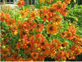
Helenuim 'Moerheim Beauty' or Sneezeweed

Sneezeweed blooms in Late Summer-Mid Fall. It grows 4-6 feet tall and likes full sun. It's 2-3 inch wide flowers are highly attractive to bees. It is a good cut flower. Sneezeweed tolerates drought,