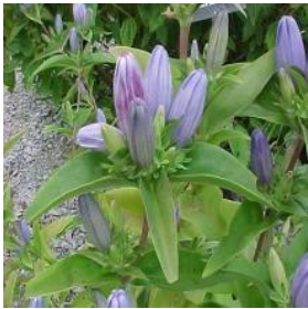
Gentiana andrewsii or Closed Gentian

This Toad Lily grows 18-24 inches tall. It likes partial to full shade. The orchid-like flower makes a good cut flower. The foliage of this variety is variegated.