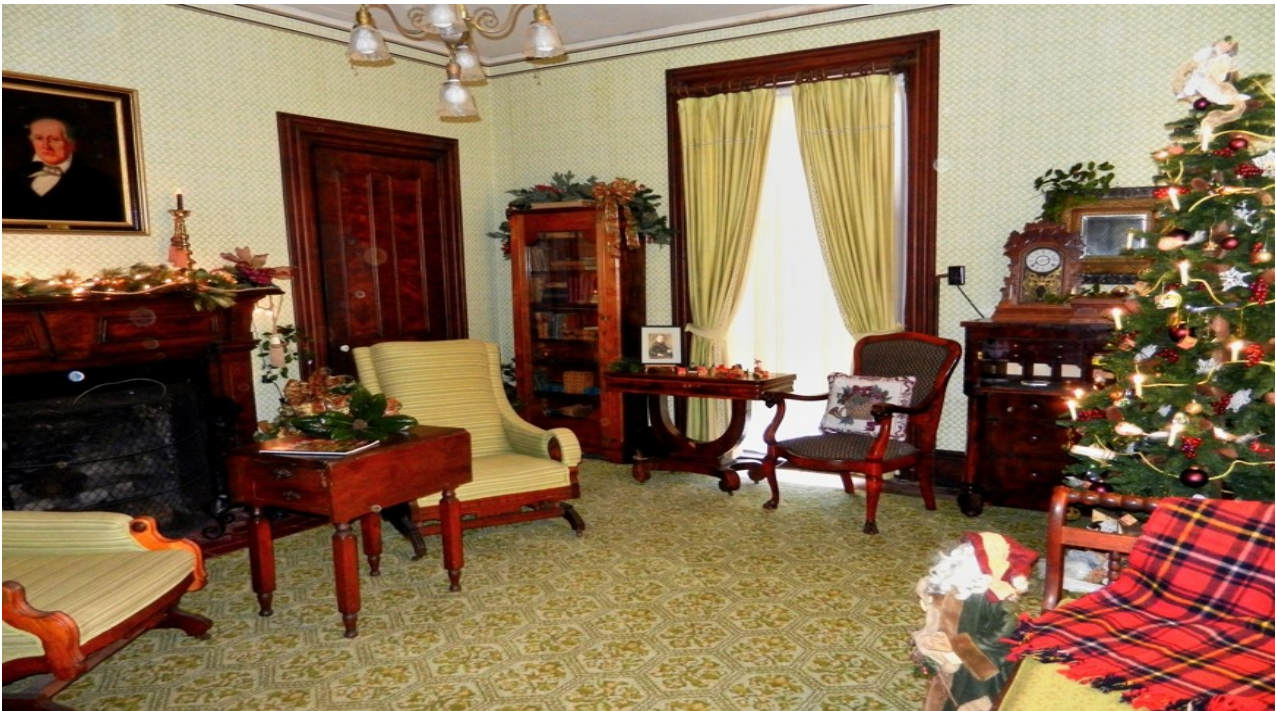
A Parlor at Maplewood House decorated by Columbia Garden Club Members.