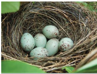
Blue Jay Nest with Eggs