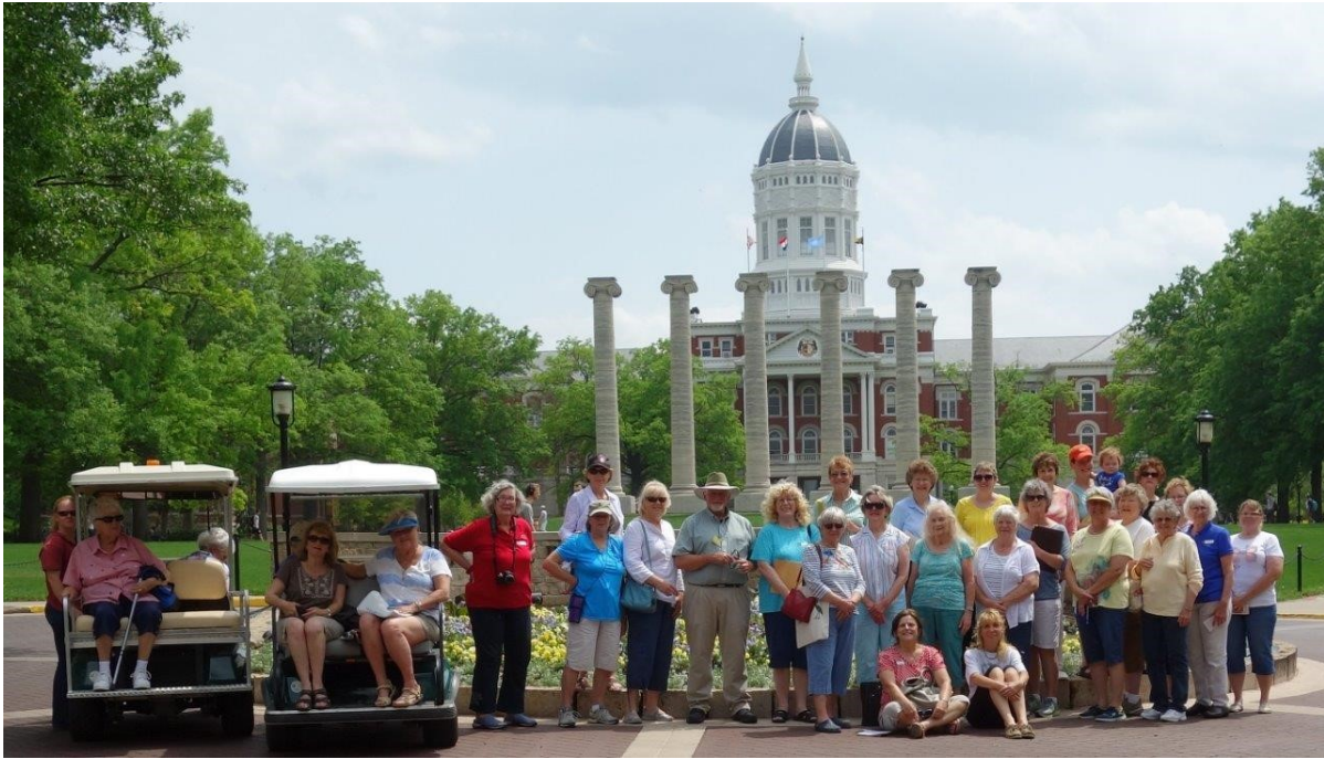
Columbia Garden Club touring the Mizzou Botanic Garden for our May meeting.