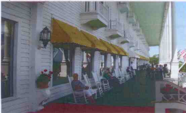
Porch at Grand Hotel

What a spectacular resort area! Take a scenic drive around Old Mission Peninsula where cherry orchards abound, then along Pierce Stocking Scenic Drive in Sleeping Bear Dunes National Lakeshore. Visit a charming port town and the Cherry Republic . Breakfast and Lunch included