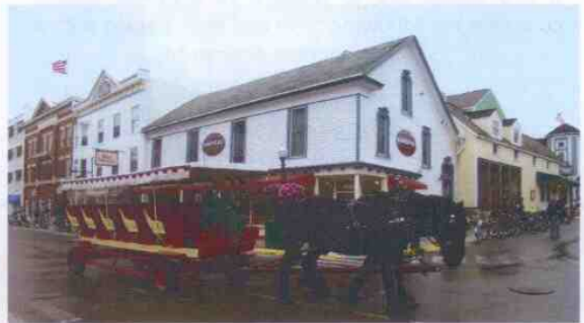
Horse Drawn Carriage Tour