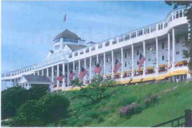
The Grand Hotel