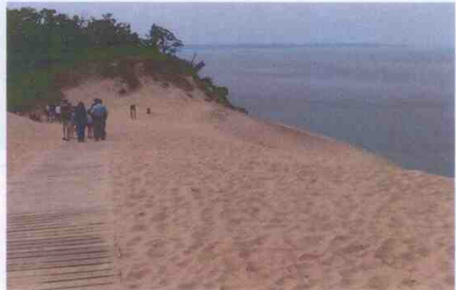
Sleeping Bear Dunes National Lakeshore