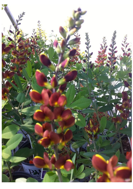
Baptisia Cherries Jubilee, available at Vintage Hill.