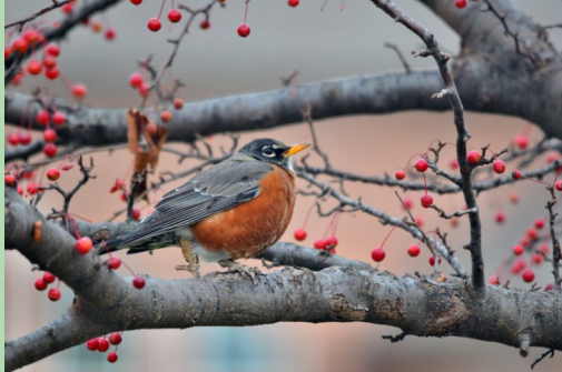
"Ruffled Robin". Featured on local evening news channel.