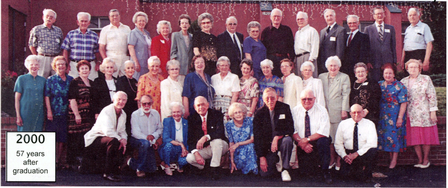
2000 57 years after graduation