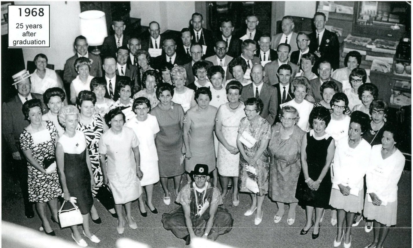
IT IS WELL NIGH IMPOSSIBLE to provide names for group pictures such as these. Perhaps the reader will be able to recognize many of the folks in the crowd. In the picture above, we had been out of school only 25 years so we had not changed too much. In the picture below, we're starting to gain some white hair, a few wrinkles and perhaps even a bit of weight around the middle. But I betcha you remember more than you think. jbf

Pictures of the class reunions of 1963, 1973, 1983, 1993 and 2003 were printed in the March, 2011 edition of the '43 Kewpie Notes