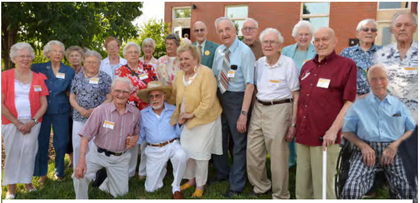
Pictured above at the Friday evening banquet, June 7, 2013 are 70th Anniversary attendees

The June, 2013, 70th Anniversary Reunion of Hickman High Class of 1943 was a first! No other class has held a 70th